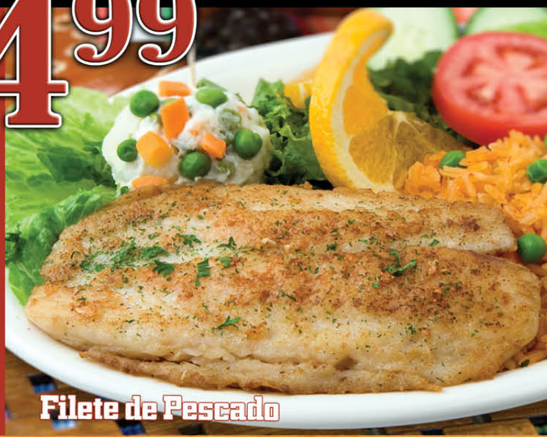
Filete de Pescado