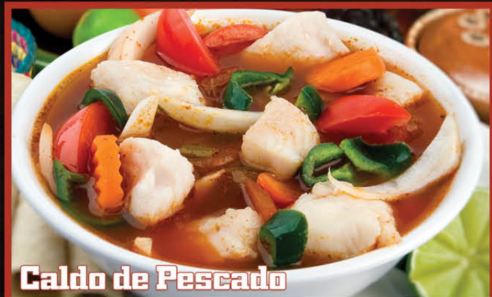
Caldo de Pescado