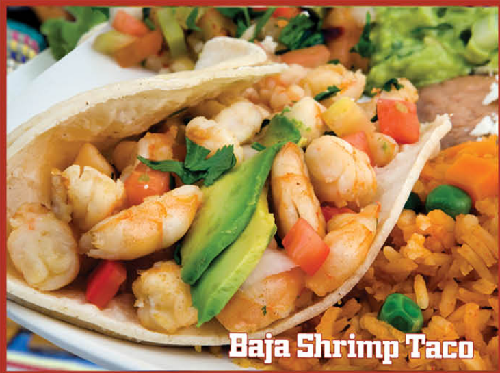
Baja Shrimp Taco