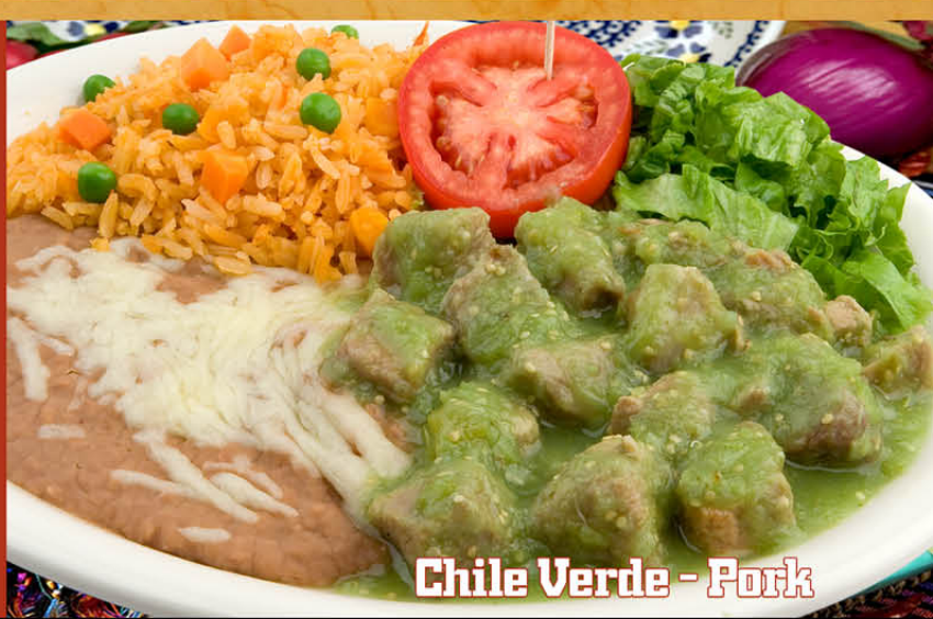
Chile Verde - Pork