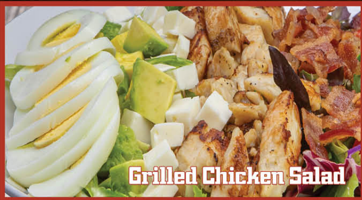
Grilled Chicken Salad