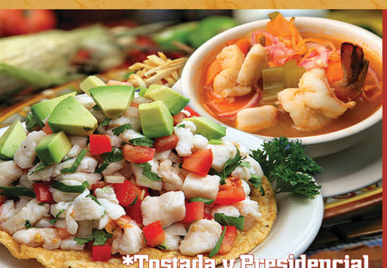
*Tostada y Presidencial