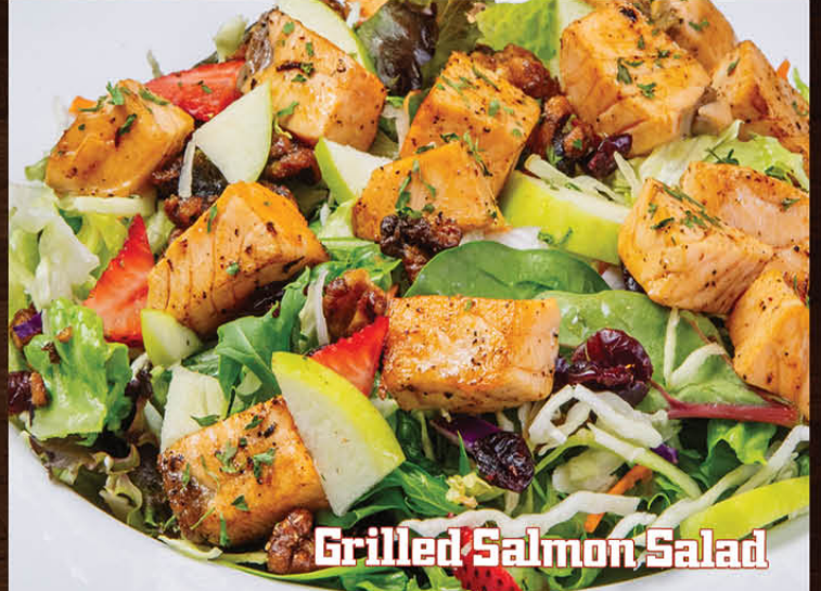
Grilled Salmon Salad