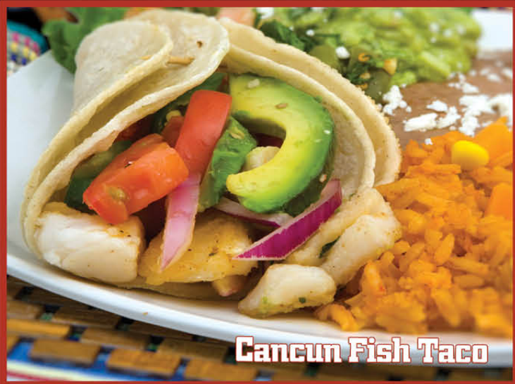
Cancun Fish Taco