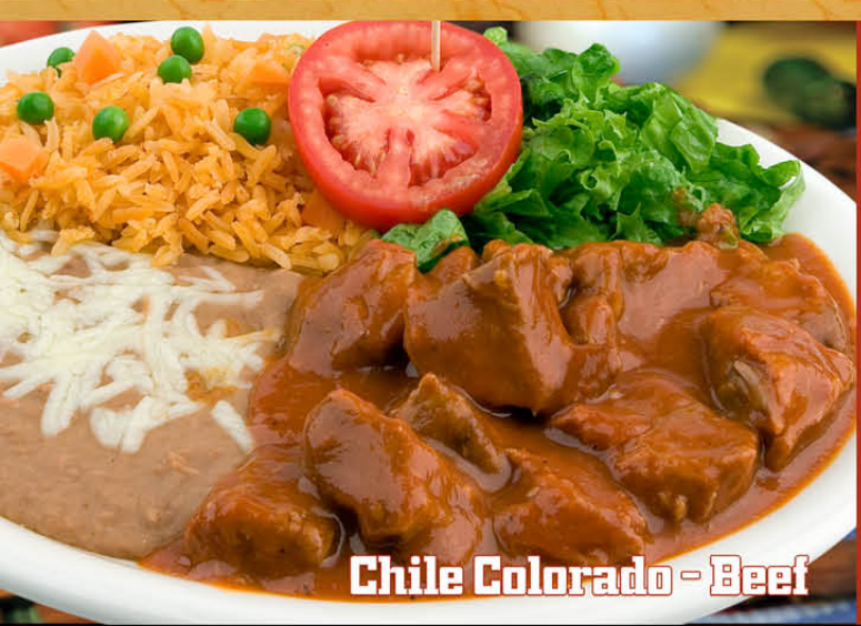
Chile Colorado - Beef