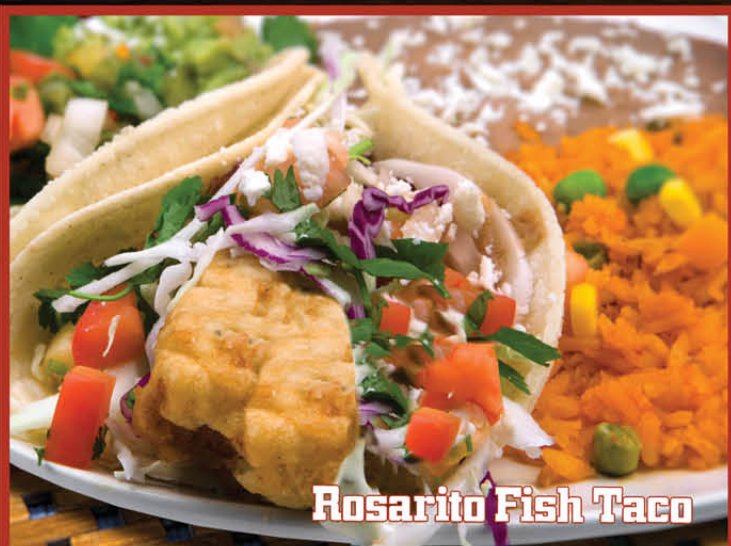
Rosarito Fish Taco