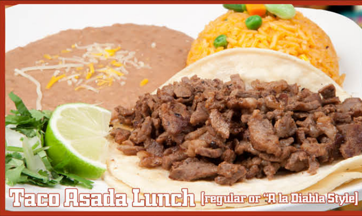
Taco Asada Lunch (regular or "A la Diabla Style")