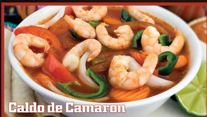
Caldo de Camaron