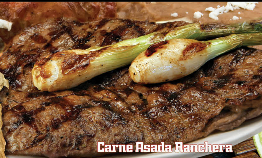
Carne Asada Ranchera