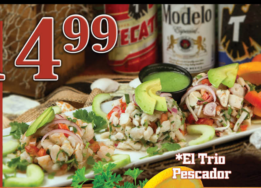
*El Trio Pescador