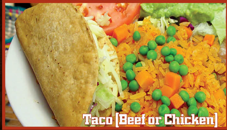
Taco [Beef or Chicken]