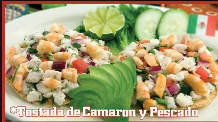
*Tostada de Camaron y Pescado