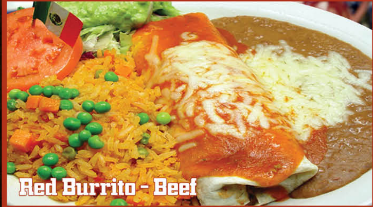
Red Burrito - Beef