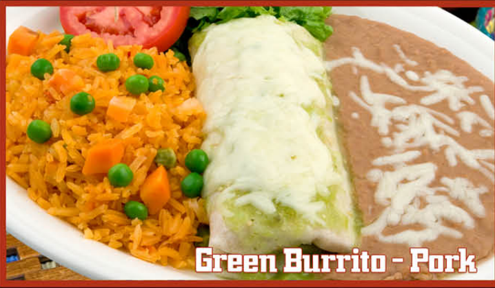
Green Burrito - Pork