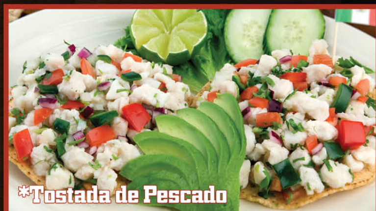
*Tostada de Pescado