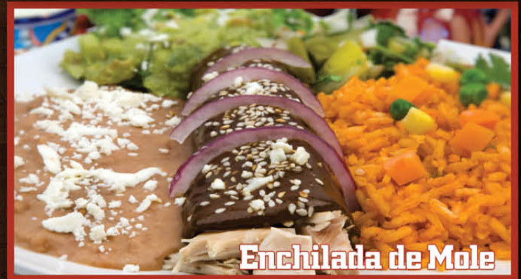
Enchilada de Mole