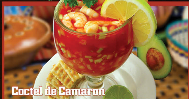
Coctel de Camaron